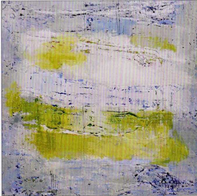
Window Series #7 , Encaustic and Oil Stick on Wood Panel, 29" x 29", 2013