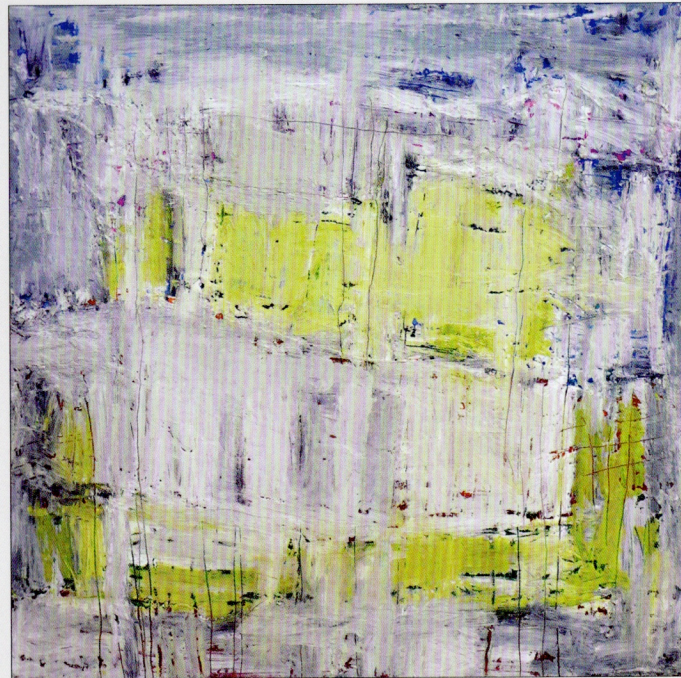
Window Series #8 , Encaustic and Oil Stick on Wood Panel, 24" x 24", 2013