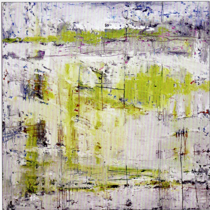
Window Series #9 , Encaustic and Oil Stick on Wood Panel, 24" x 24", 2013